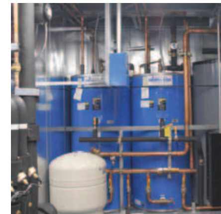
You can use up to 100% of the available waste heat from your system.