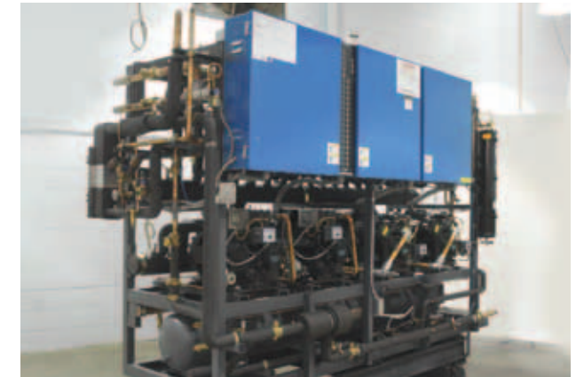
Horizontal receiver assemblies are just one example of the many system configurations we offer

Whatever focus or priorities required by your application, we have the options and configurations to meet them. Some of those may include multiple suction headers, split systems, remote manifolds, remote panels and a host of others from a complete list to provide a refrigeration system that meets your specification and imagination.