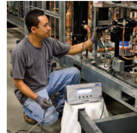
Systems are leak-tested during production with a safe, green-labeled gas.

The Hill PHOENIX Enviroguard™ System is a low charge refrigeration system that allows optimal refrigerant management. The minimal refrigerant charge is obtained by isolating the receiver from the normal refrigeration circuit and using it as a storage tank for refrigerant charge required to adjust for seasonal changes in system operation. In addition to optimal refrigerant management, the Hill PHOENIX