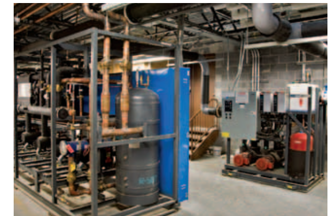
Second Nature® system and pump station