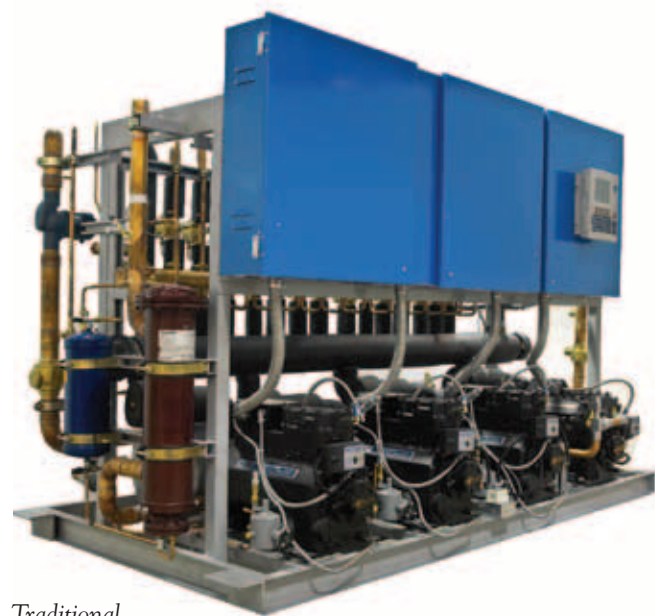
Traditional parallel racks