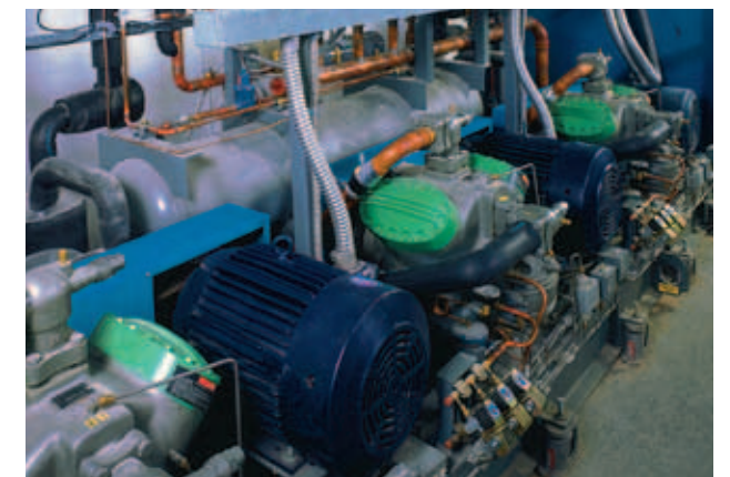
Open drive compressors are just one of the many compressor choices you have