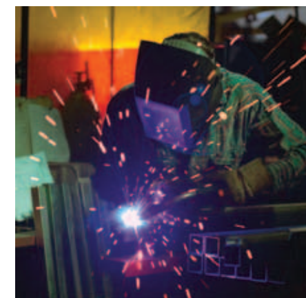
We provide a rigorous certification program for all brazers in our factories.

Enviroguard system operates in an energy efficient manner to lower your energy use as well.