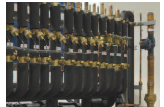
Electronic evaporator pressure regulators are available to meet or exceed your specifications